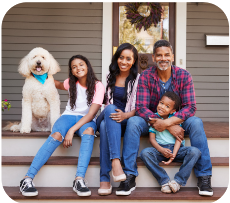
CHART A COURSE WITH CPFS

You may not be able to turn your house into a mansion, but you can always find a nicer castle. Now is the best time to lock in a low rate on a Cedar Point Mortgage when you buy a new home. The summer is a great time to enjoy where you live instead of just paying for it. Visit cpfcu.com/mortgage-services to apply. Any house can be made a home if you buy with a Cedar Point Loan.